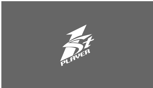
PC GAMING CASE Mi2-A